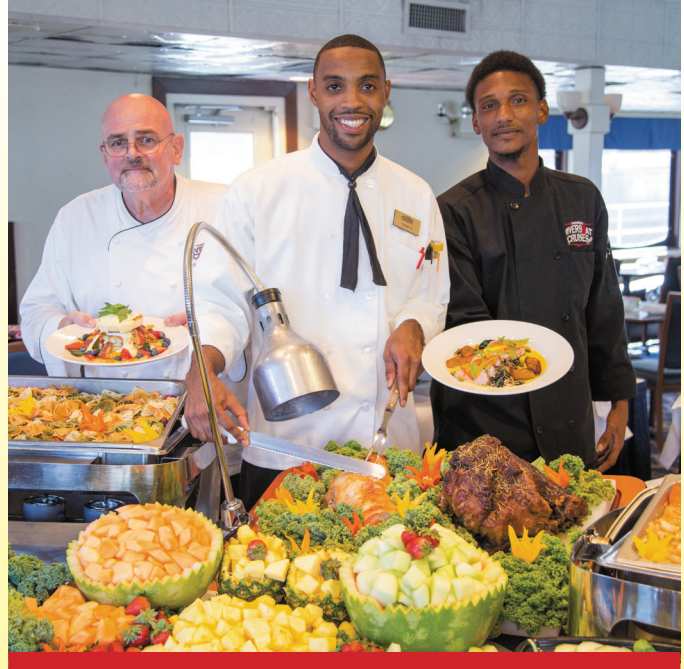
DINNER ENTERTAINMENT CRUISE

1 p.m. lasts 1.5 hours (reservations required) Sundays from March–October